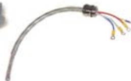
EMC Cable & Glands