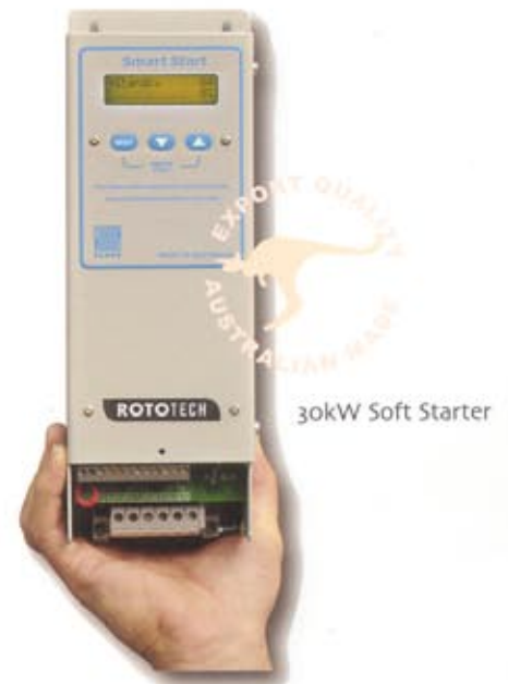
30kW Soft Starter