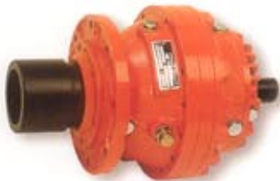
PLANETARY REDUCERS & GEAR MOTORS