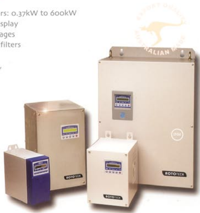
Selection of Zener Speed Controllers with IP66, IP30 and Stainless Steel Enclosures