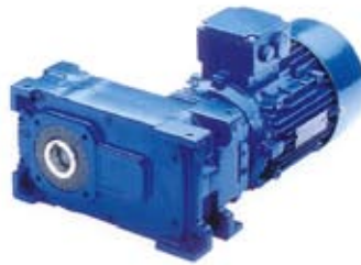
PARALLEL SHAFT BEVEL HELICAL