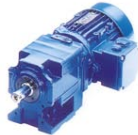
INLINE HELICAL REDUCERS & GEAR MOTORS