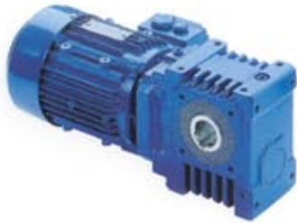
RIGHT ANGLE WORM & HELICAL WORM

Rototech supply a comprehensive range of power transmission equipment with thousands of combinations to suit most industrial needs.