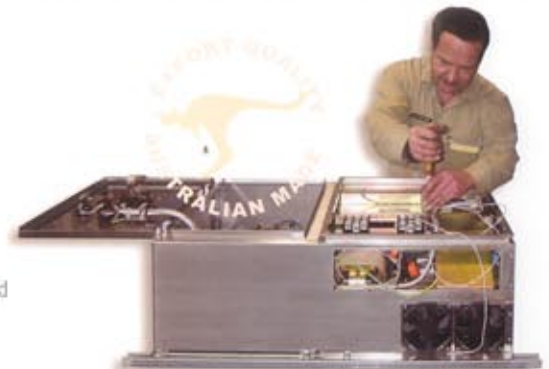
75kW Variable Speed Package built by Rototech with IP66 Stainless Steel Enclosure