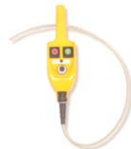
Pendant with Lead

Choice of In-Built Radio Remote or Pendant with Lead