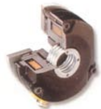
Brake (cutaway view)