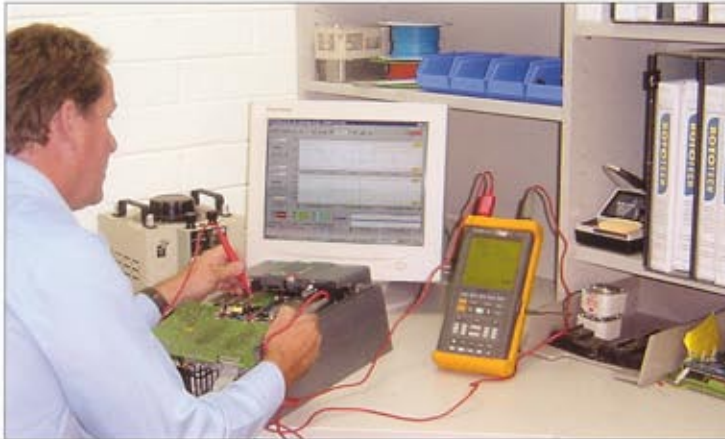
Testing and Repair Service