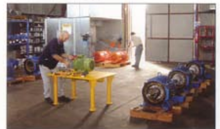
Workshop equipped for building and modifying electric motors to meet customer requirements