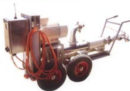
11kW Zener Drive Package with Radio Remote on a Positive Displacement Wine Pump

Choice of In-Built Radio Remote or Pendant with Lead