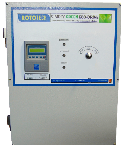
140 Amp Pump package