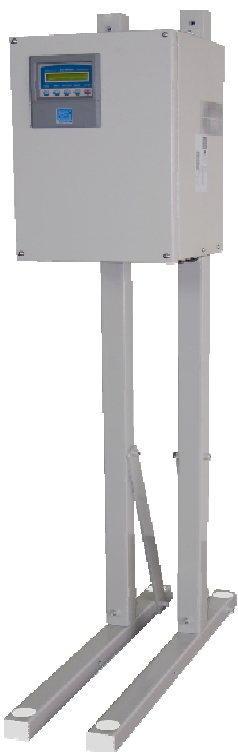
40 Amp drive fitted on mounting frame

Or, arrange for our liscenced Technicians to do your installation for you and we will include a FREE paddle Flow Switch with a market value of $148.00 with each package ordered in 2010